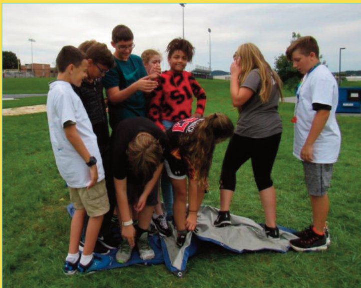
Students teamed up to flip a tarp while standing on it.

During Outdoor Education Days in September, SVMS sixth graders participated in cooperative learning activities that promoted skills essential for the classroom and beyond. Students learned effective teamwork in a fun and challenging environment through activities that included team t-shirt decorating, building card towers, creating journals, using map skills, escaping and following directions.