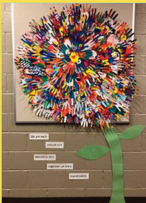
6th graders created unique hands to show that their individual characteristics make up a masterpiece.

During Outdoor Education Days in September, SVMS sixth graders participated in cooperative learning activities that promoted skills essential for the classroom and beyond. Students learned effective teamwork in a fun and challenging environment through activities that included team t-shirt decorating, building card towers, creating journals, using map skills, escaping and following directions.