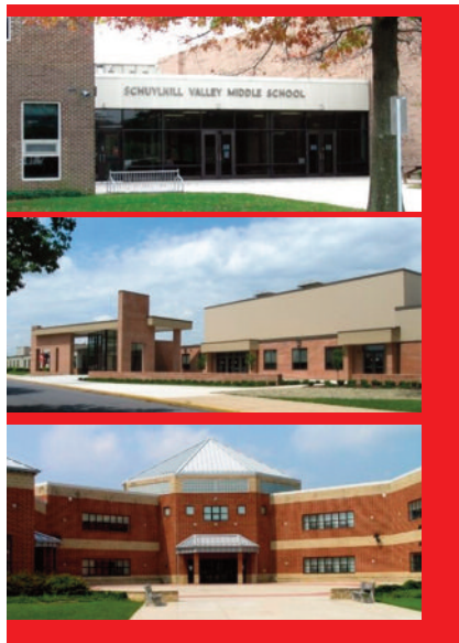
schuylkill valley SCHOOL DISTRICT